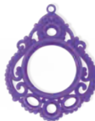
Visijet M3 CAST