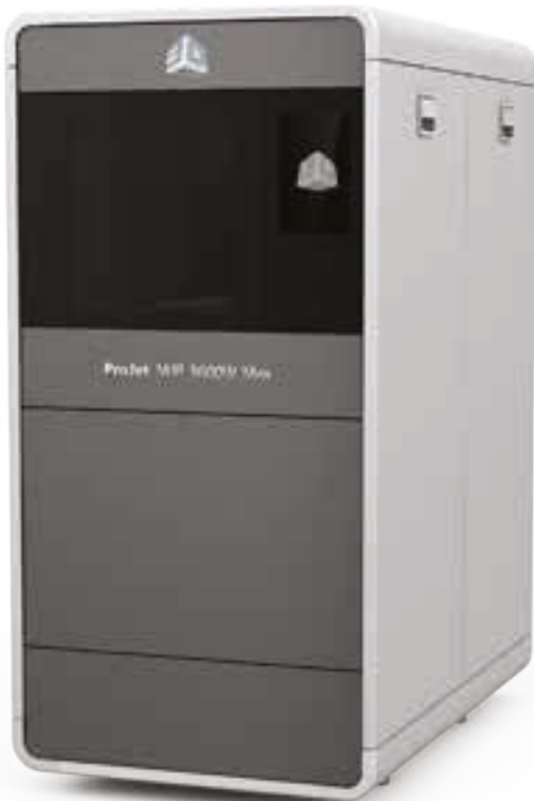
Projet MJP 3600W Series high-capacity, high throughput precision wax pattern 3D printer

Print sharp edges, extreme crisp details and smooth surfaces with high fidelity, ideal for intricate precision metal parts manufacturing with reduced metal hand polishing.