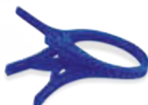
Visijet M3 Hi-Cast