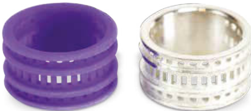
Ring printed in Visijet M2 CAST and cast