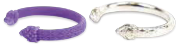
Visijet M2 CAST