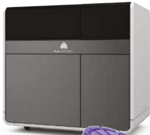
Projet MJP 2500W fast and affordable precision wax patterns 3D printer

With 3.7X or more larger build volume capability than similar class printers for broader applications versatility and 24/7 operation, Projet MJP wax printers' high productivity means fast amortization and high return on investment.