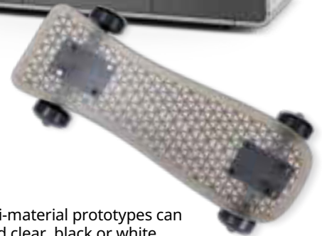
Multi-material prototypes can blend clear, black or white to communicate ideas and simulate finished products