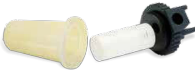
Functional filter prototype printed in clear, white and black rigid plastics