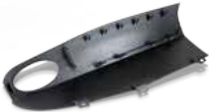
New rigid black plastic Visijet® CR-BK enables even more composite mechanical performances

Print realistic medical models in rigid and elastomeric materials