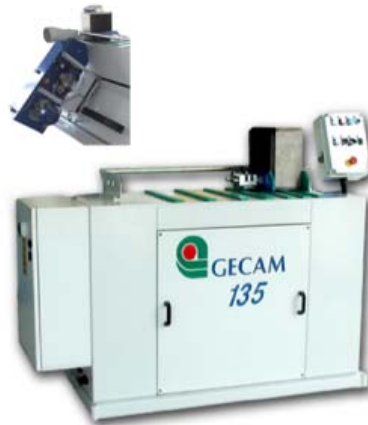
Mod. Kw mm. Kg 135 3 2000 x 150 220