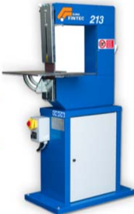
Mod. Kw mm. Kg 213 2.2/1.5 2000 x 12-100 130