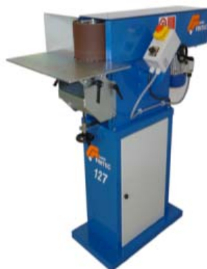
Mod. Kw mm. Kg 127 2.2/1.5 2000 x 150 105