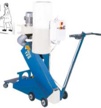
Mod. Kw mm. Kg 125-4R 4.5 2000 x 75 130