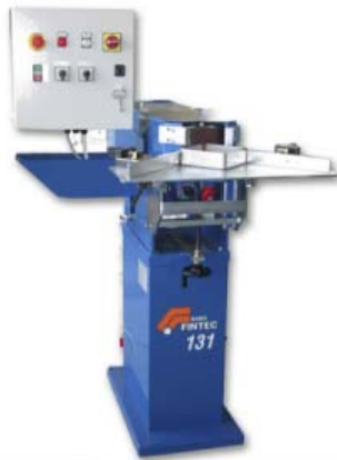
Mod. Kw mm. Kg 131 2.3/1.5 2000 x 150 120