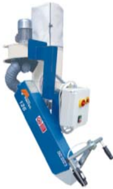
Mod. Kw mm. Kg 126 4.5 2000 x 75 96