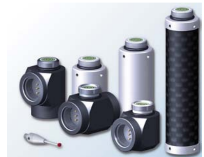
Various accessories available

** With accessories (e.g. extension, angle): max. acceleration 10 m/s 2