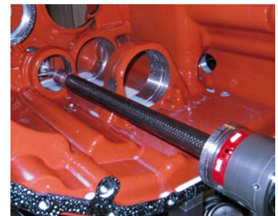
Mass production of gearbox housings