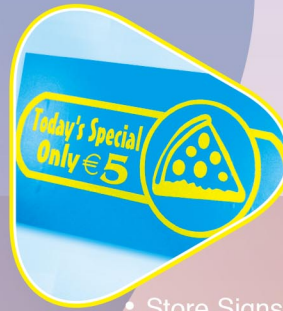
• Store Signs