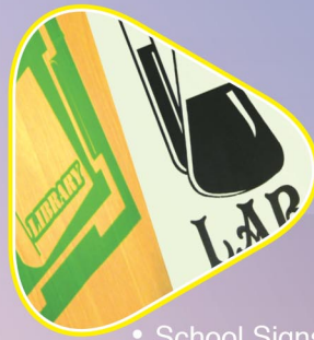
• School Signs