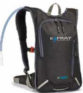
Optional Long Range backpack with additional 2–litre tank

The strength of the charged particles is greater than that of gravity, so they are immediately attracted by the surface and do not fall to the ground.