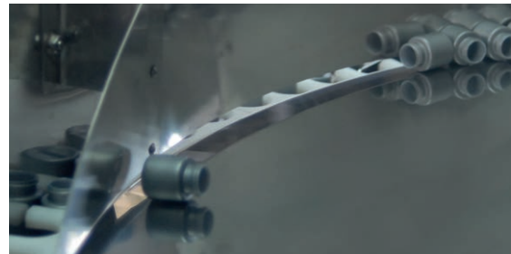
Inside detail of the POSIPHARMA-13 unscrambler

The containers or caps are loaded into the unscrambler by a Hopper Elevator where they are distributed on the upper rotating disk (1) and fed in to the "selectors" located around the periphery of the disk (2). There is no potentially damaging mechanical manipulation of the containers or caps during the unscrambling process; the containers or caps are moved simply by air and gravity .