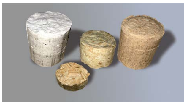
Briquet-Ø=40 mm Styrofoam / coarse wood / soft and hardwood