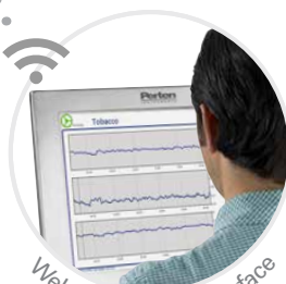
Web-based User Interface