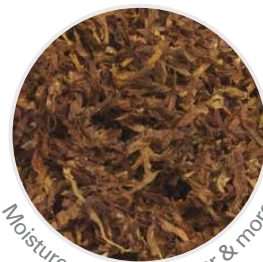
Moisture, Nicotine, Sugar & more