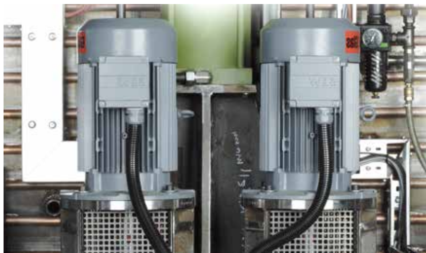
Drive motors of the two oil circulators

Symmetrically arranged circulators ensure that the hardening oil is strongly, turbulently mixed and fed via guidance channels through the charge. The process results in uniform hardening and minimal distortion. At the same time the speed of the oil circulation defines the type of quenching and with it the result of the heat treatment. It can be very flexibly controlled using the process software, Carb-o-Prof®.