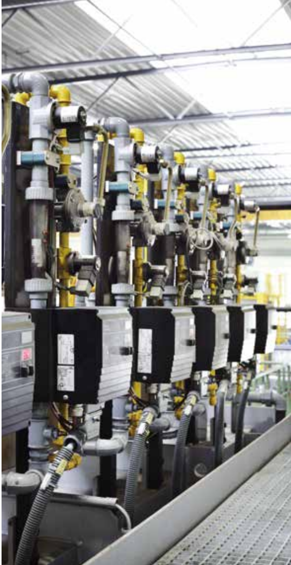
Mixing battery and control electronics of a Recon®-heating system

a very long service life, not least because the heating elements do not come into contact with the process gases. In addition they do not cause any environmental pollution and do not cause any noise emissions.