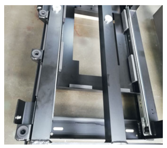
SNAPLOC® system, consisting of coupling and bolt, used in a seat of the company Probatec AG.