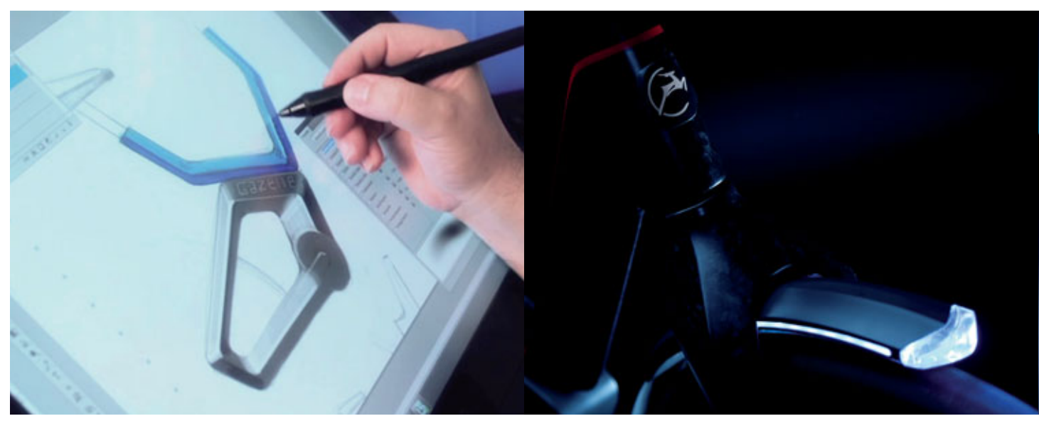
Gazelle N°1: E-Bike of the future

In September 2015, the Dutch King Willem Alexander opened the new production facility – the most modern bicycle factory in the world.