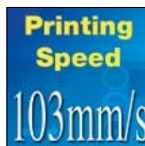
"Fastest" mobile printer in the market!