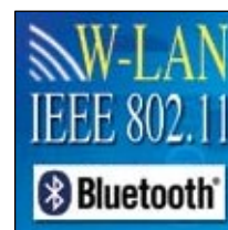
Wireless connectivity option with LCD display