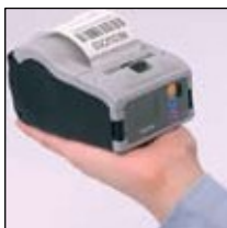
Sturdy, yet sleek and ergonomic that fits in your hand