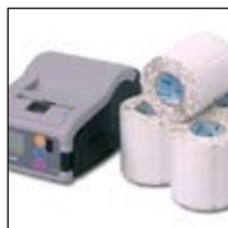
Lasting battery operation due to newly adopted battery cell technology