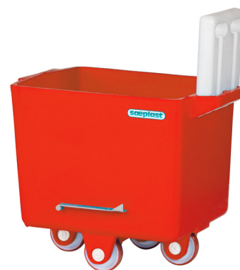
PUR Sæplast 185 Buggy