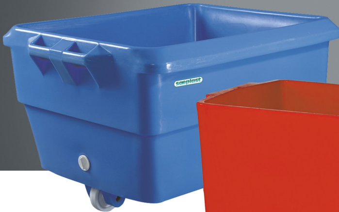
PUR Saeplast 340 Cart