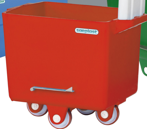
PUR Saeplast 185 Buggy