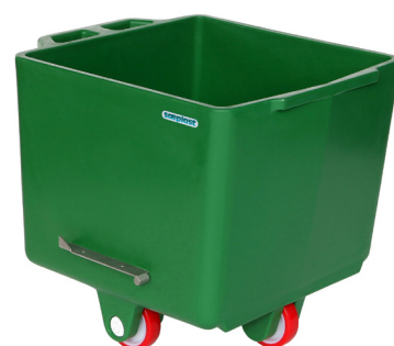
PE Sæplast 200 Buggy