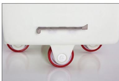
Integrated stainless steel brackets.