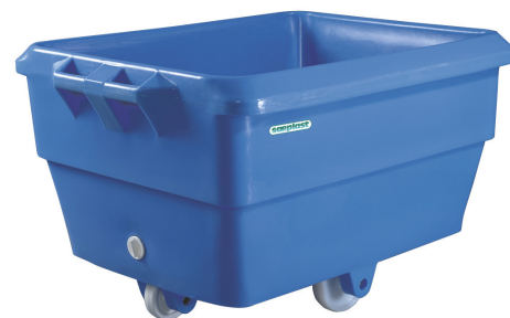
PUR Sæplast 340 Cart

The versatile Carts and Buggies are available in various colours enabling you to have dedicated Buggies for different colour coded zones.