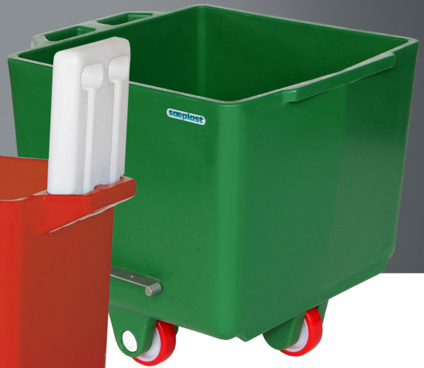
PE Saeplast 200 Buggy