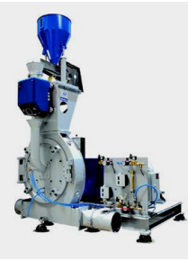
Fine cutting mill PM

Our range of cutting mills covers everything from low-speed beside-the-press granulators to compact cutting mills - with or without soundproofing - to high-performance cutting mills for heavy-duty applications. Thus, we provide customised solutions for almost any application in the injection moulding, blow moulding, extrusion and recycling industries.