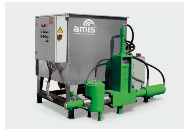
Briquetting press ZBP 50 - 70