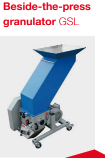
Beside-the-press granulator GSL