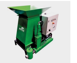
Briquetting press ZBP 40