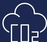
The company adopts and certifies the Life Cycle Assessment (LCA)