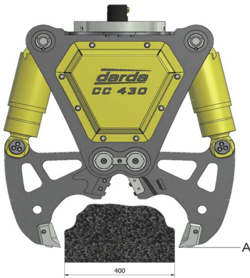
Crusher with standard tips

Mounting plates of different carriers on request