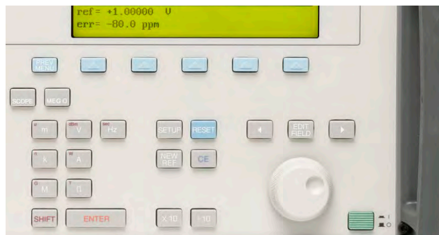
The 5080A lets you easily slew the calibrator output.