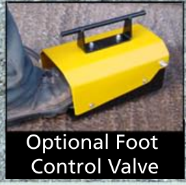
Optional Foot Control Valve