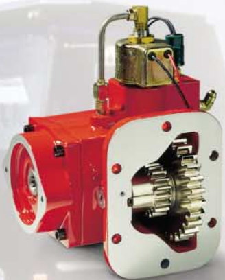
250 and 251 Series

The 250 Series features the latest PTO technology for automatic transmissions. The Controlled Compression Interface Gasket eliminates the setting of gear backlash. The lightweight housing design allows for maximum heat dissipation, and there is excellent gear contact ratio for quiet operation. Electronic Overspeed Control is available to protect your driven equipment.