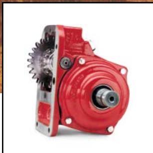
231 and 271 Series