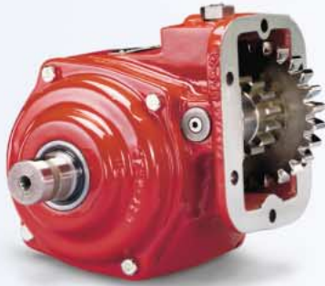
230 and 270 Series