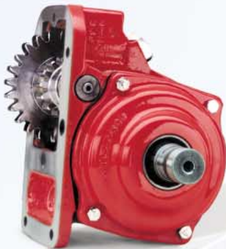
231 and 271 Series

Low-profile housing with the 231 offers easier installation. Both designed for standard 6-bolt transmission apertures with 1-1/4" round shaft; flanges available to direct-mount hydraulic pumps. This unit offers the popular 360° rotatable pump flange.