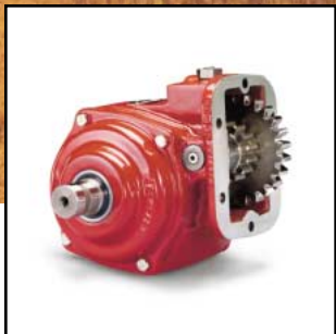
230 and 270 Series