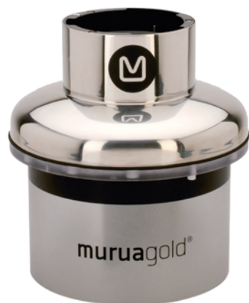
Machine main body