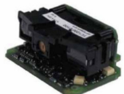
TC1200 SCAN ENGINE MODEL