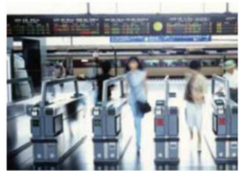
Access control and Ticketing