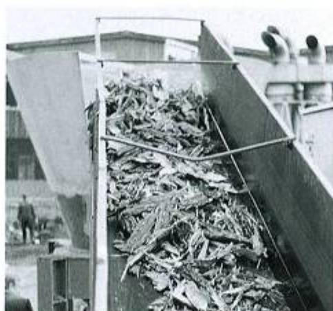
Belt conveyor to the Bark Shredder