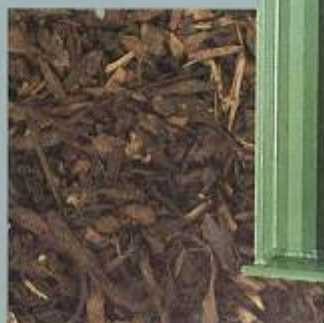
Final product B: for garden and landscape gardening