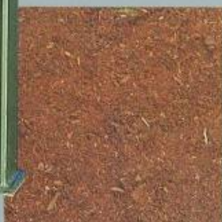
Final product C: for the composting