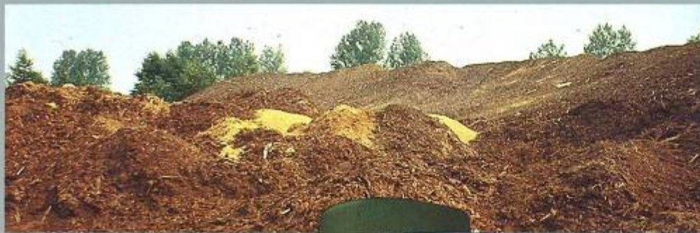
Feed material: Bark