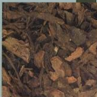
Final product A: for the combustion