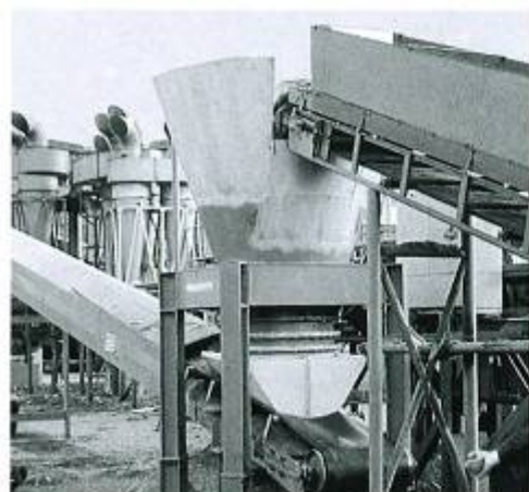
Bark Shredder with feeding and evacuation devices