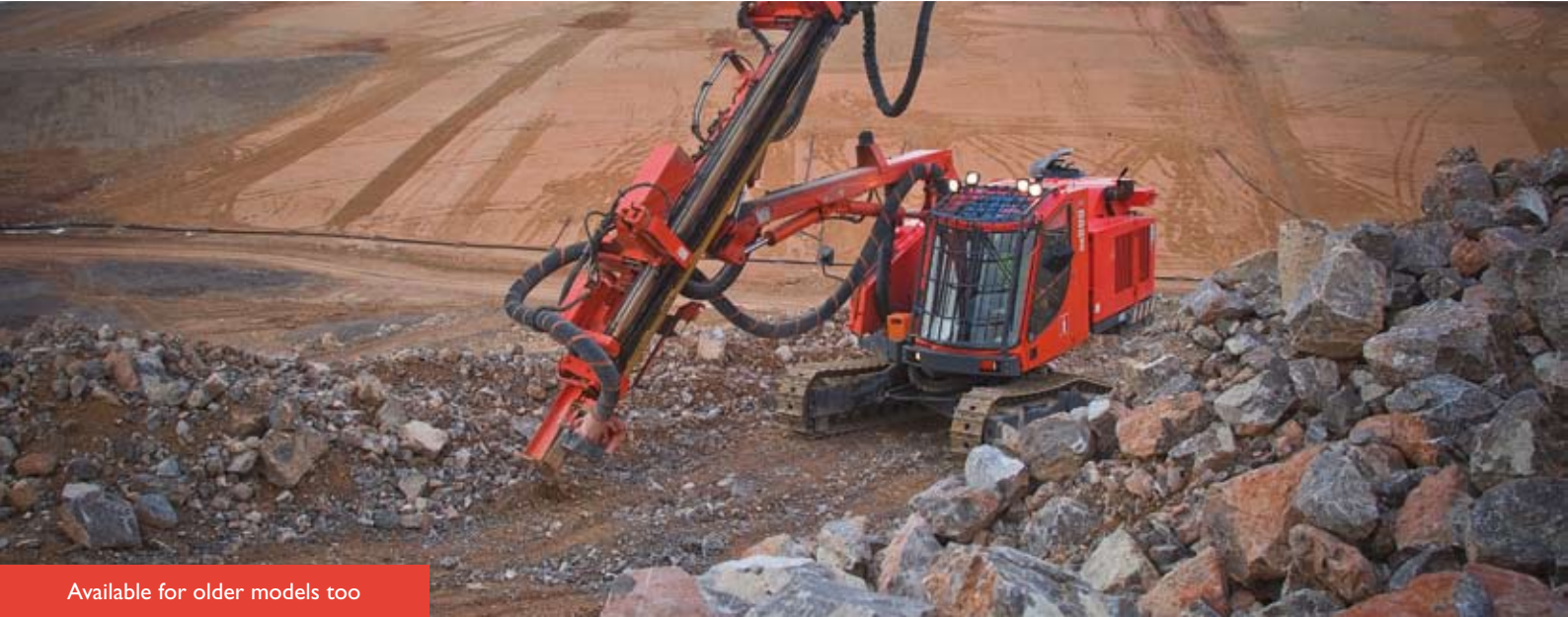
Available for older models too